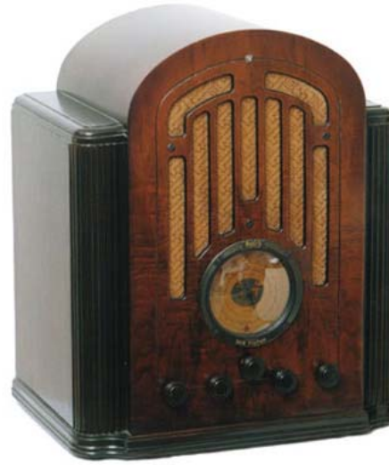
RCA Model 128 Superheterodyne